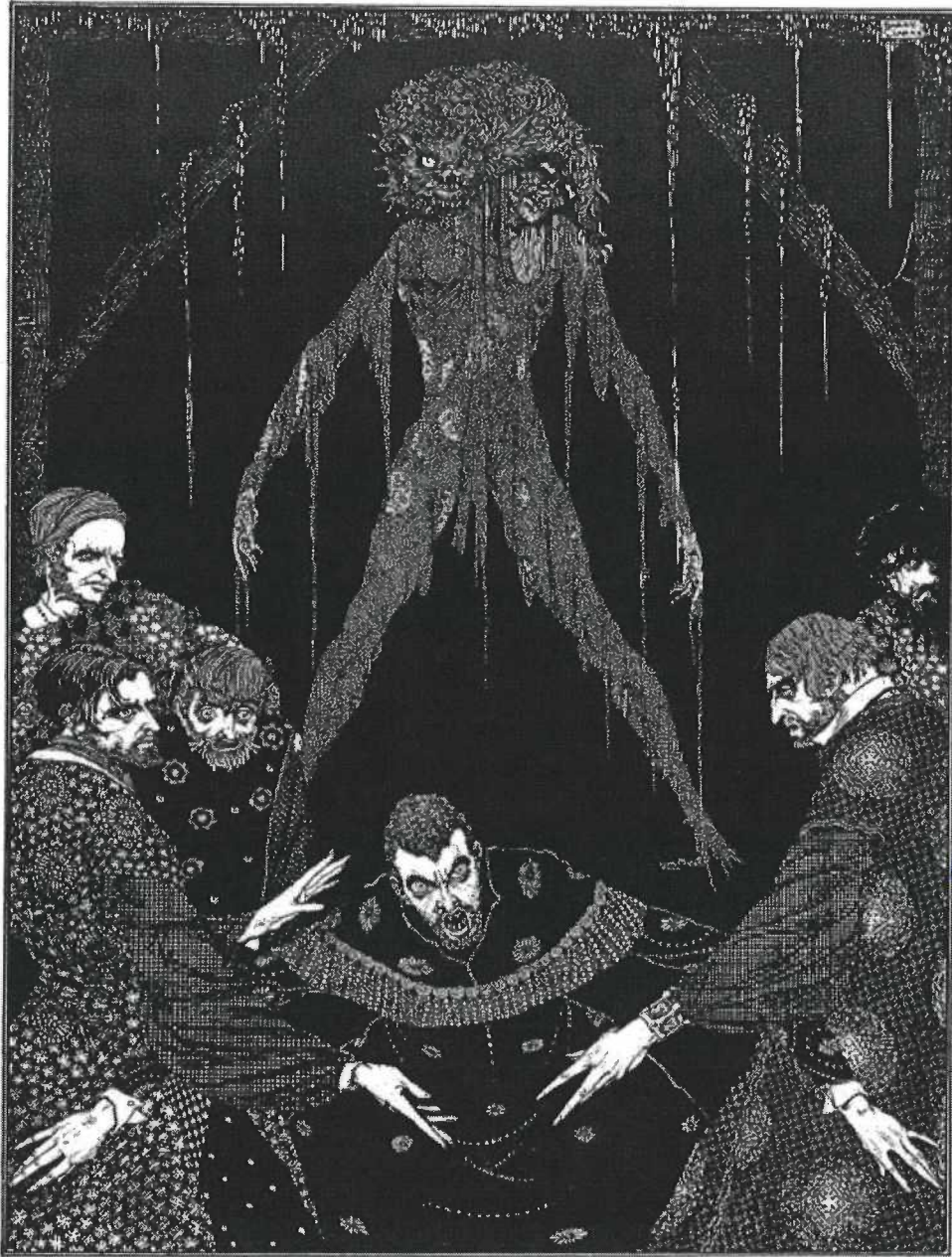
Illustration by Aubrey Beardsley