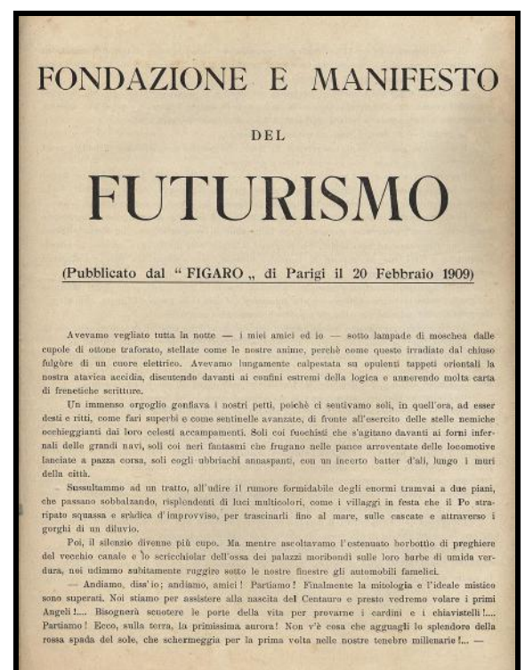
Tommaso Marinetti's futurism manifesto