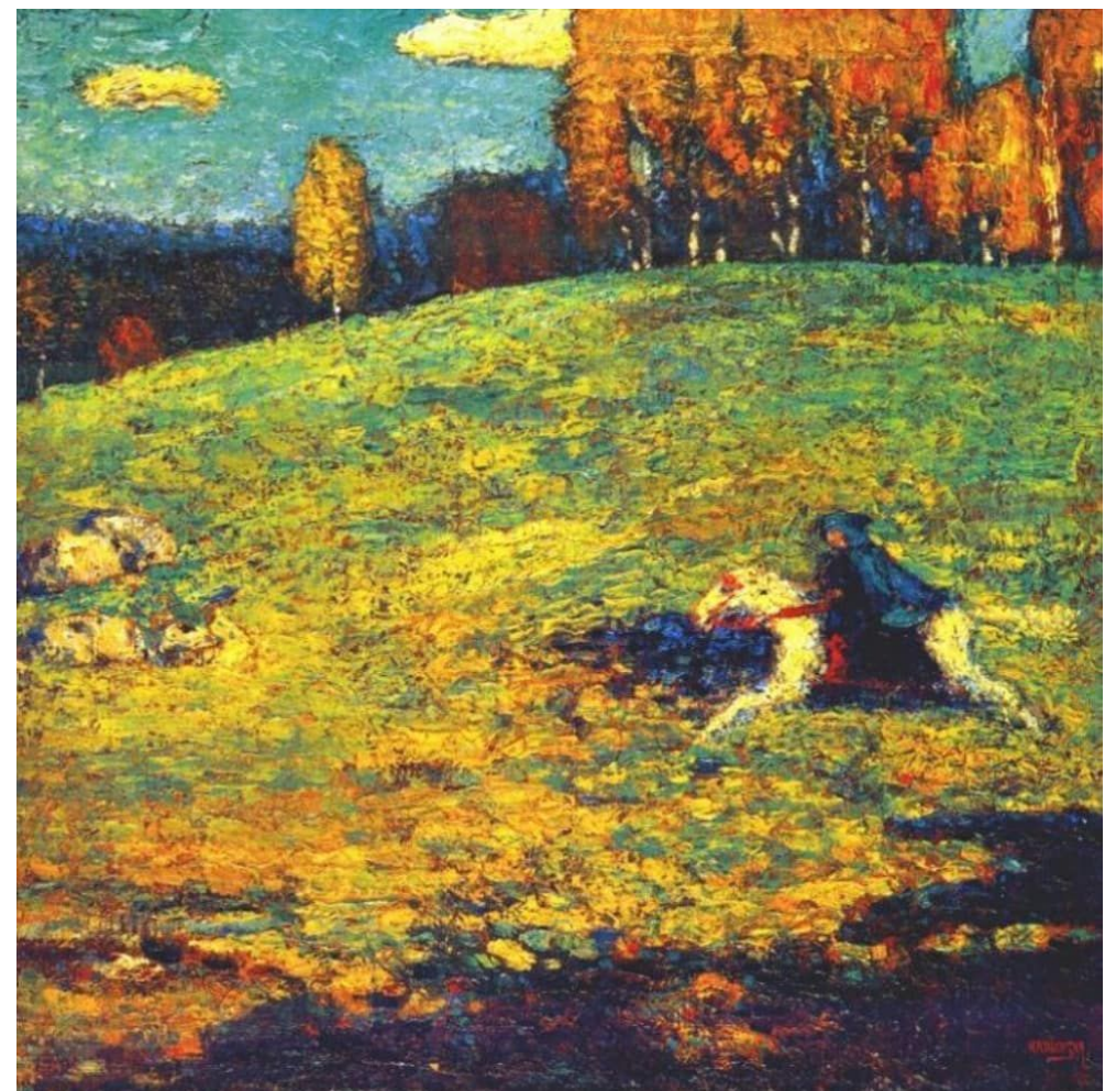
Der Blaue Reiter (The Blue Rider), Wassily Kandinsky, 1903

Der Blaue Reiter was brought to its end by World War I